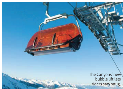
The Canyons' new bubble lift lets riders stay snug.

The days of freezing your tuckus off on the lift may be going the way of the dodo, starting at The Canyons in Park City, Utah, which debuts North America's first heated chairlift this season. Seats warmed to about 55 degrees keep you toasty, while a transparent overhead bubble swings down to protect you from the elements. The high-speed quad lift connects the Grand Summit Hotel with the Sun Peak lift.