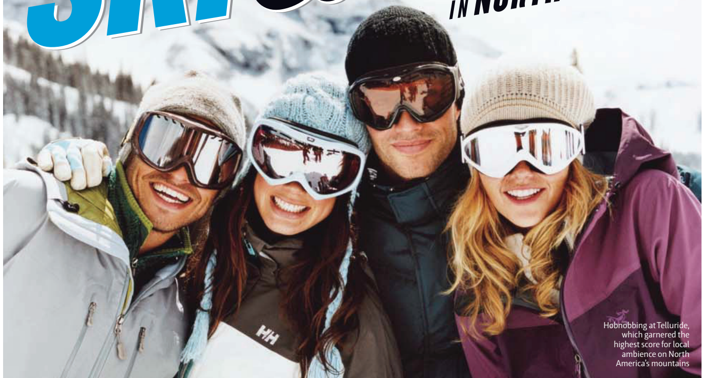
Hobnobbing at Telluride, which garnered the highest score for local ambience on North America's mountains

WE SHARE THE TOP SKI EXPERIENCES, AS VOTED BY READERS IN OUR FIFTEENTH ANNUAL SURVEY —FROM THE MOUNTAIN RESORTS THAT LET POWDER HOUNDS PLAY HARD TO THE HOTEL HAVENS THAT ENABLE YOU TO REST EVEN HARDER